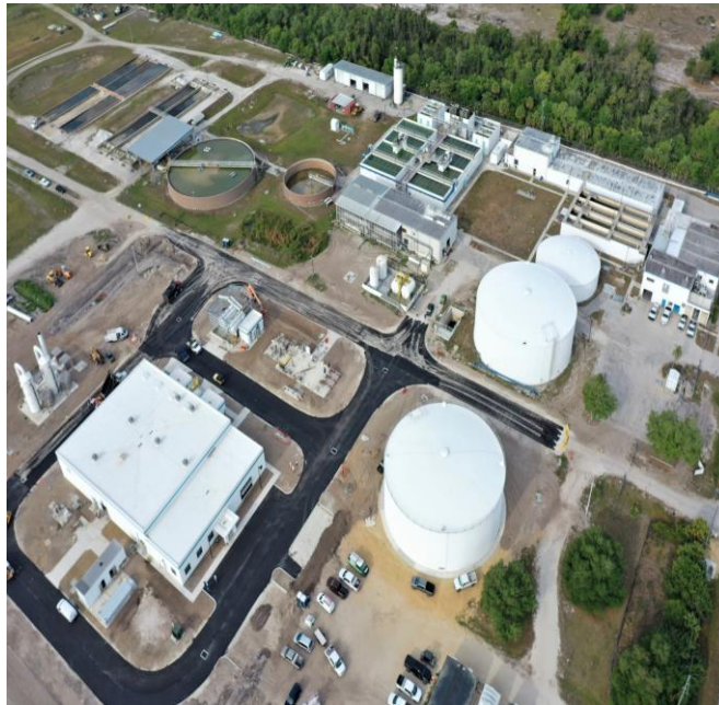
Week 91- Started to asphalt the driveways around the RO Plant.