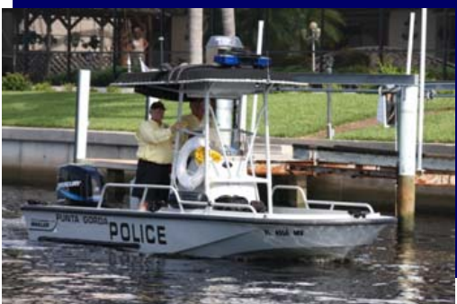
Code Enforcement Volunteers