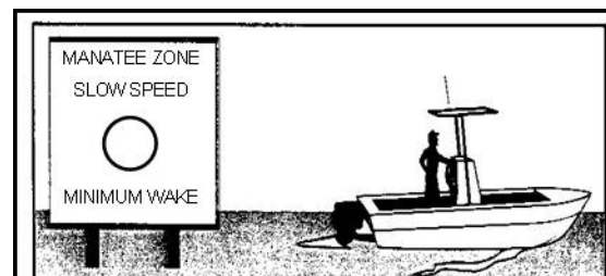
SETTLED IN THE WATER AND NOT PLOWING. ENHANCED PENALTY FOR ENDANGERING MARINE LIFE.